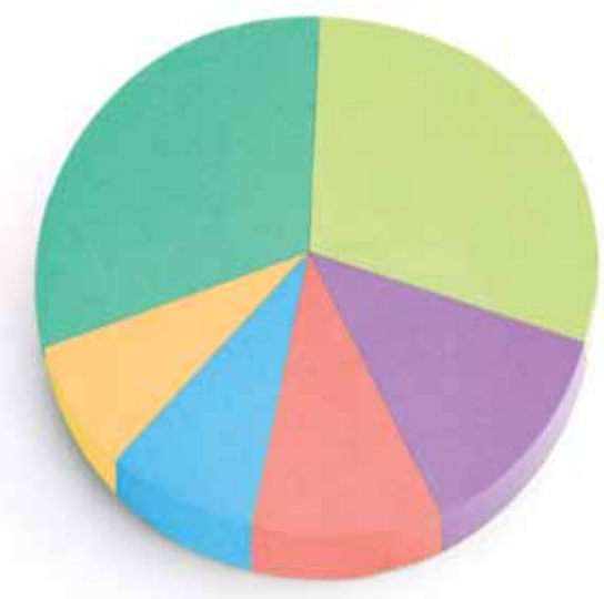
Operating Expenditure by Services