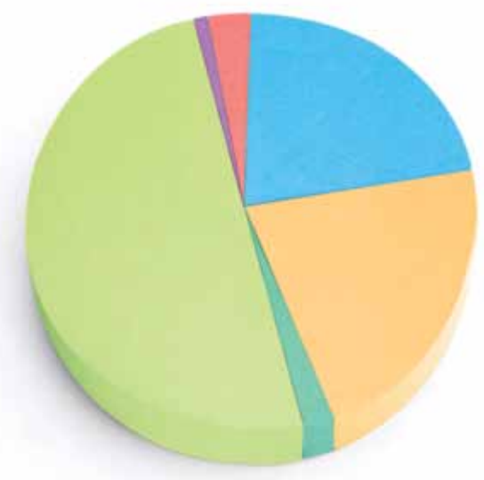
Analysis of Income